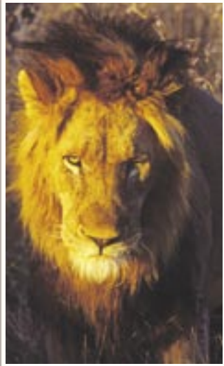
Lagoon Camps BOTSWANA