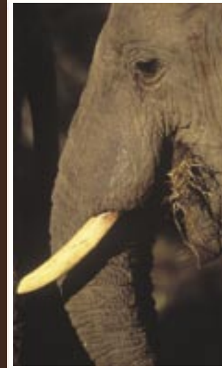
Songwe Village ZAMBIA