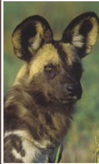
Kwara Camps BOTSWANA